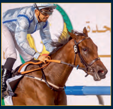
HERE WE ARE

winner Maiden Fillies' Stakes, placed in a Gr. 1 & Gr. 3 sold at Tattersalls Ireland Goresbridge Breeze Up Sale by Tradewinds Stud to Blandford Bloodstock for €52,000