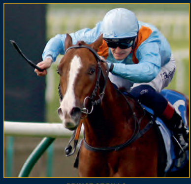
PRINCE OF PILLO

winner Mooresbridge Stakes, Gr. 2 sold at Tattersalls Ireland Goresbridge Breeze Up Sale by San Antone Lodge to Noel Meade for €54,000